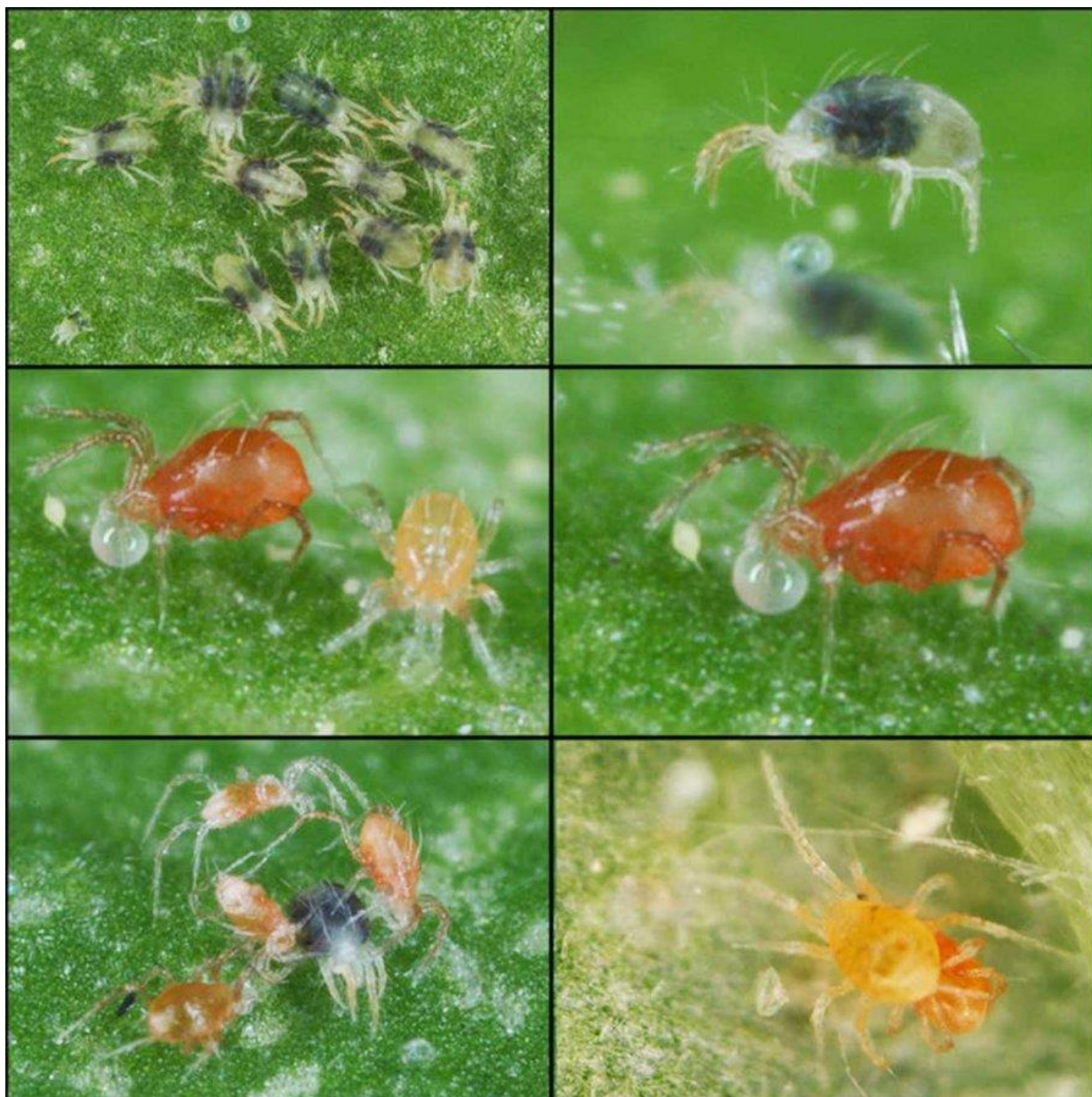
Fig. 1. Predatory mite Phytoseiulus persimilis Athias-Henriot and its feeding on spider mites

( http://nsau.edu.ru/images/people/lra/middle-middle-color-center-center-1-0-0-1446306449.673.jpg )