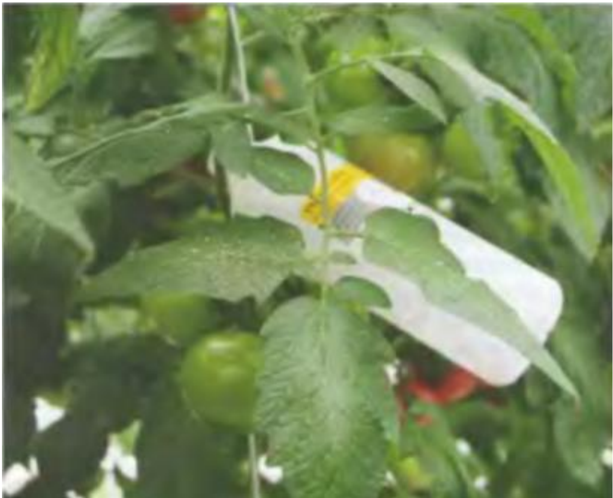
Fig. 3 Application of phytoseiulus in a greenhouse on tomatoes

Local method – release near the pest focus, which includes the examining greenhouses once a week. Depending on how the leaf blade is damaged, on average 10–60 individuals are released per plant. Phytoseiulus is applied on soybean leaves, each of which contains up to 10 individuals. In foci with a high density, spider mites are released in the predator-victim ratio 1 : 50 and in addition 20–30 individuals per neighboring plants that are not infected with the pest.