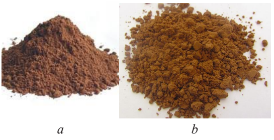
Fig. 1. Grape seeds powder: a - GSP; b - DGSF

Powders were obtained under industrial conditions. At first grape seeds were separated from pomace, dried at a room temperature and subjected to the thorough purification (separation). Then GSP (grape seed powder) was obtained by superfine grinded. Another powder type DGSF (defatted grape seed flour) was obtained by extraction of oil of grape seeds by cold pressing. Pomace, created after grape seed pressing was superfine grinded up to flour. This powder type is a commercial product at the Ukrainian trade market, realized as a trademark OleoVita (Orion, Ukraine) ( Fig. 1 ).