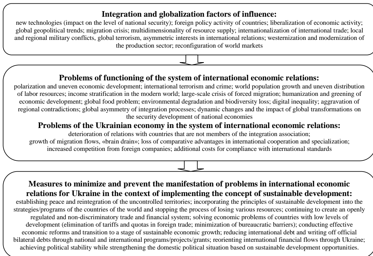
Figure 2. Opportunities for Ukraine to minimize and prevent the manifestation of problems of international economic relations in the context of implementing the concept of sustainable development

The main objectives of Ukraine's economic policy are to ensure dynamic socio-economic growth through the introduction of scientific and technological factors and the efficient use of production factors. In addition, the tasks include maintaining macroeconomic balance; conducting social and economic reforms (aimed at restructuring the institutional system, balancing the economy, social sphere and environment); diversifying integration processes, and expanding into the markets of underdeveloped countries. At the same time, considering the state of integration of the national economy of Ukraine into the world economy allows us to detail the profile of international specialization, identify promising areas of international cooperation with countries that have the greatest potential and determine the directions of changes in the structure of the national economy. This provokes problems that need to be addressed immediately and intensifies competition in the domestic and global markets for goods (services); emigration of labor force for permanent residence. In such changing conditions and uncertainty, business entities operate on the basis of sustainable development. Fig. 2 schematically presents measures to minimize and prevent the manifestation of negative integration and globalization processes on the economy of Ukraine on the basis of sustainable development [6, 7, 21, 22].