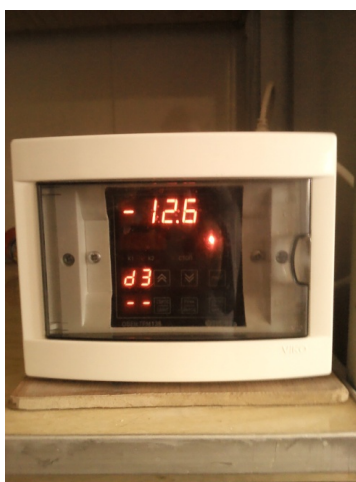
Fig. 1. General look of the multi-functional eight-channel measurer-regulator OWEN TPM 138-R with an automatic transformer of interfaces OWEN AS 4

The results processing was realized using software Owen Process Manager (“OWEN” company, city Kharkiv, Ukraine) by building thermograms in the studied temperature interval.