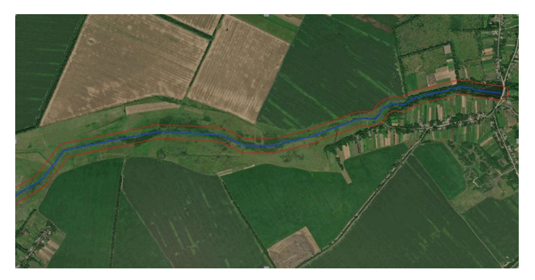
Fig. 1. River vector with a constructed buffer of the 100 m coastal protection zone.

protection zones, urban planning restrictions and other areas with a particular legal regime. Buffer zones are created automatically according to the specified parameters, and QGIS allows you to build them around objects of any type and shape (Fig. 1).