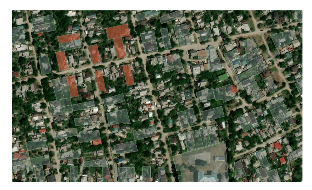
Fig. 3. Search and display of newly formed land plots on the public cadastral map layer (newly formed land plots are coloured red, existing land plots are coloured green)

QGIS provides the ability to connect and use dynamic WMS such as Sentinel Hub and Planet Explorer. This feature allows to track changes in the territory with a particular frequency, which has become especially relevant in connection with active hostilities in Ukraine. By connecting these services and comparing their data with the public cadastral map, the areas that have been shelled can be recorded. This allows for spatial analysis to identify areas in need of humanitarian demining, as well as agricultural areas that have been chemically contaminated by explosives, etc. (Fig. 4).