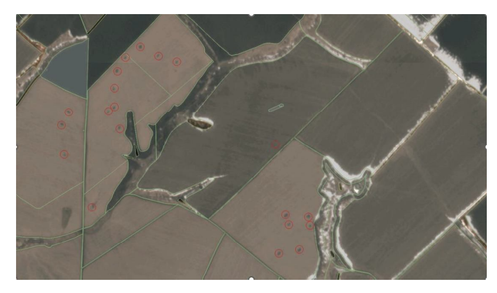
Fig. 4. Land plots that have been shelled and may contain explosive ordnance and chemical contamination (red marks craters from explosions)

QGIS provides the ability to connect and use dynamic WMS such as Sentinel Hub and Planet Explorer. This feature allows to track changes in the territory with a particular frequency, which has become especially relevant in connection with active hostilities in Ukraine. By connecting these services and comparing their data with the public cadastral map, the areas that have been shelled can be recorded. This allows for spatial analysis to identify areas in need of humanitarian demining, as well as agricultural areas that have been chemically contaminated by explosives, etc. (Fig. 4).