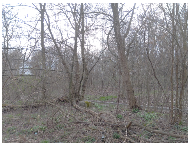
Fig. 4. The habitat of A. colonnellii .

Distribution. Central and southern Europe (Austria, Bosnia and Herzegovina, Greece, Hungary, Montenegro, Romania, Serbia, Slovakia, Slovenia); the Caucasus (Georgia); Turkey (Alonso-Zarazaga et al. , 2017). Ukraine: Lviv Region (Khrapov, Yunakov, 2020), Kyiv (Fig. 5).