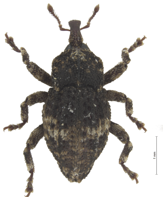
Fig. 1. A. colonnellii , ♂, dorsal view.

Material. Kyiv Region: Kyiv, M. M. Gryshko National Botanical Garden of the National Academy of Sciences of Ukraine, steppes exposition, under the bark of tree (50.411, 30.567), 01.10.2020 (V. Fursov) — 1 ♂ (SIZK) (Figs. 1–4, 5, gray circle).