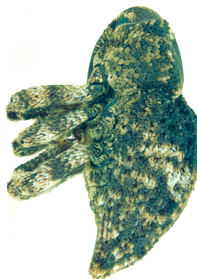
Fig. 2. A. colonnellii , ♂, lateral view.