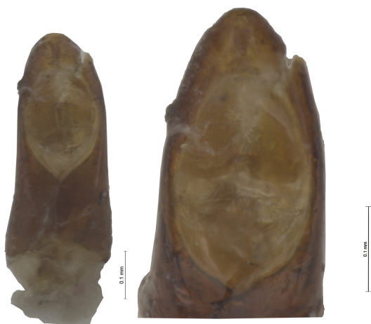
Fig. 3. A. colonnellii , ♂, median lobe: dorsal view and apex.