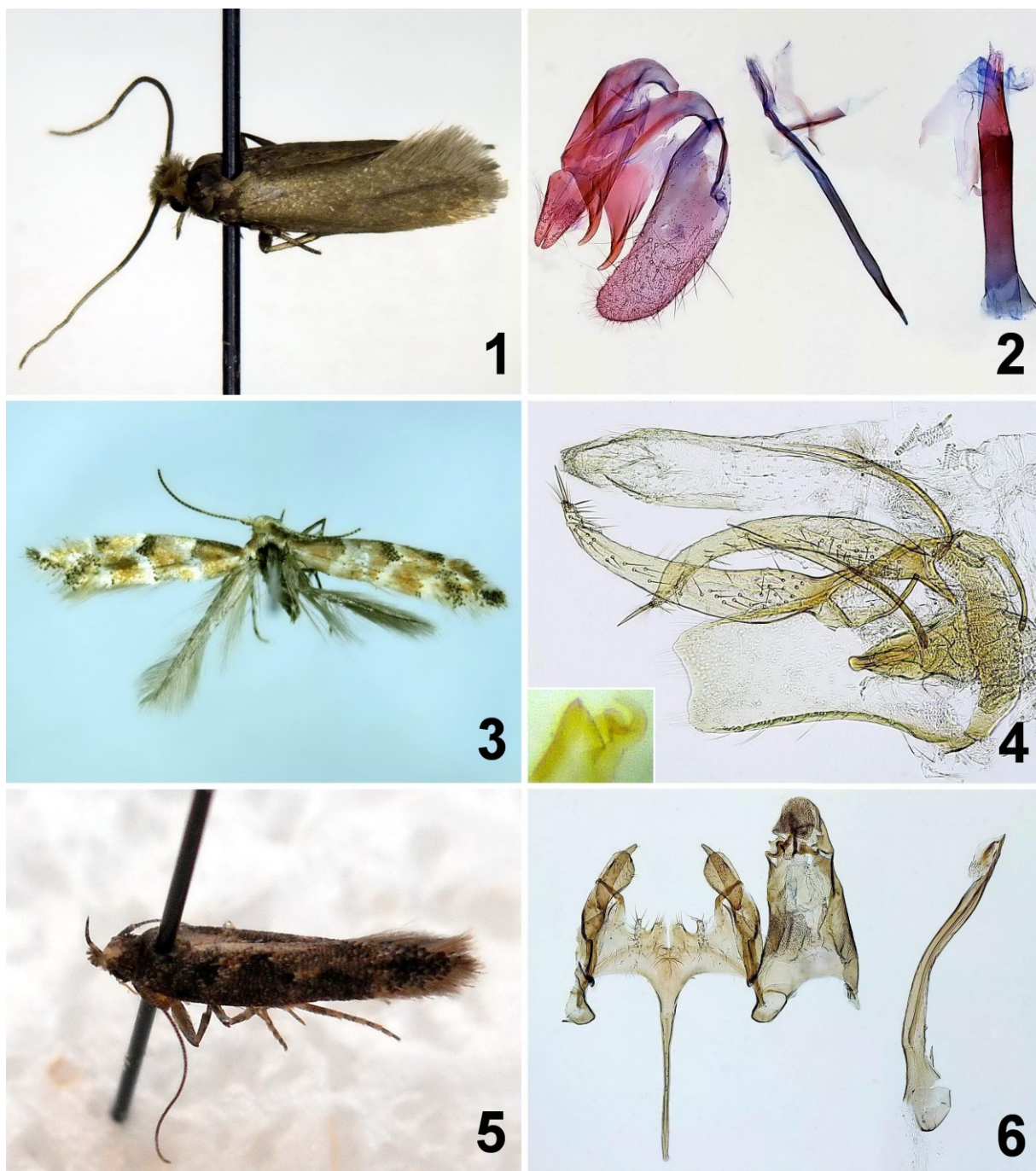
Fig. 1–6. Species of Lepidoptera new for Ukraine from NNP ‘Dvorichanskiy’ and its environs: 1 — Monopis pallidella , 16.06.2018, ♂, imago; 2 — Monopis pallidella , 16.06.2018, ♂, genitalia with right valva removed, saccus and aedeagus separated; 3 — Phyllonorycter cephalariae , 24.09.2017, ♂, imago; 4 — Phyllonorycter cephalariae , 18.09.2017, ♂, genitalia (inset: lateral view of the end of juxta); 5 — Caryocolum petryi , 22.08.2018, ♂, imago; 6 — Caryocolum petryi , 22.08.2018, ♂, genitalia.