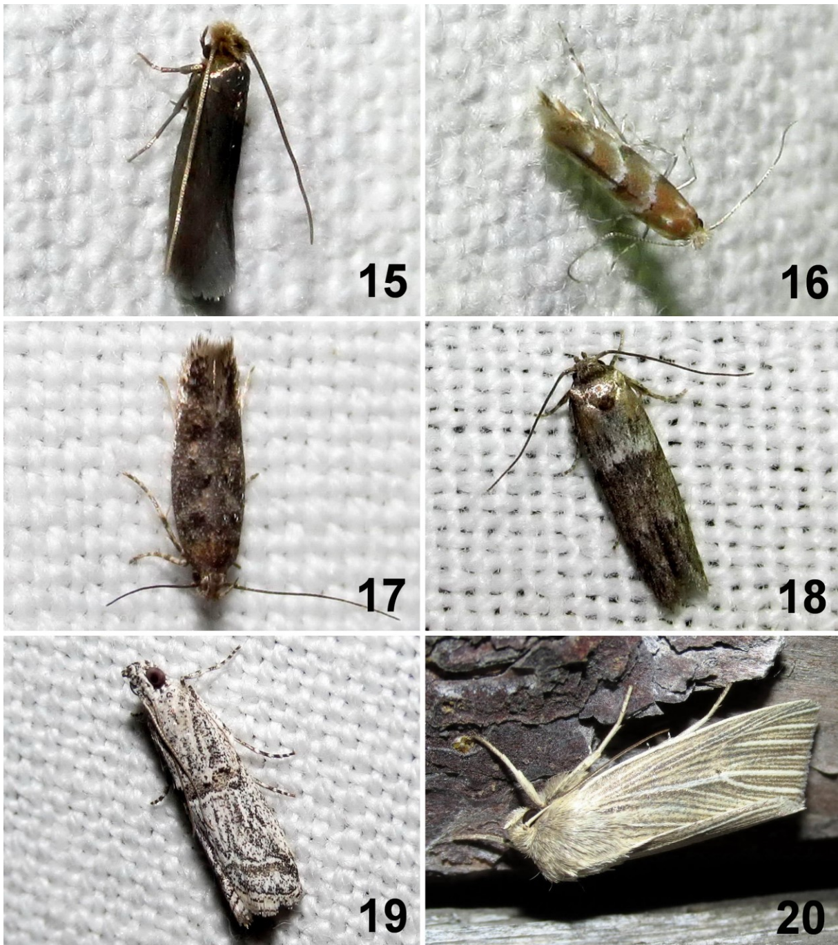
Fig. 15–20. Species of Lepidoptera new for Ukraine from NNP ‘Dvorichanskiy’ and its environs: 15 — Monopis pallidella , 16.06.2018; 16 — Phyllonorycter cephalariae , 24.09.2017; 17 — Caryocolum petryi , 24.08.2017; 18 — Blastobasis pannonica , 22.09.2018; 19 — Neopempelia hieroglyphella , 30.06.2018; 20 — Mythimna deserticola , 09.06.2017.