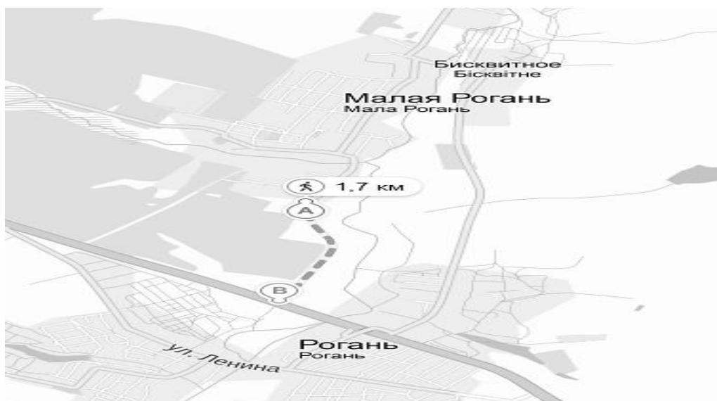
Figure 5. The concentration of Hyphantria cunea Drury in the territory of Village Council (Mala Rogan, 2014-2019).

In 2014 we discovered a new focus on the territory of Kharkiv district where our research was being conducted during 2014–2019 (the neighborhood of the village of Mala Rogan, 49° 56' 19" N, 36° 29' 26" E). In the course of conducted research it was determined that in 2014 on the territory of Village Council of Mala Rogan Hyphantria cunea Drury fed only on ash-leaved maple, which grows along the road that connects the village of Mala Rogan and the highway Kharkiv-Rostov. The length of this section of the road is 1.7 km (Figure 5).