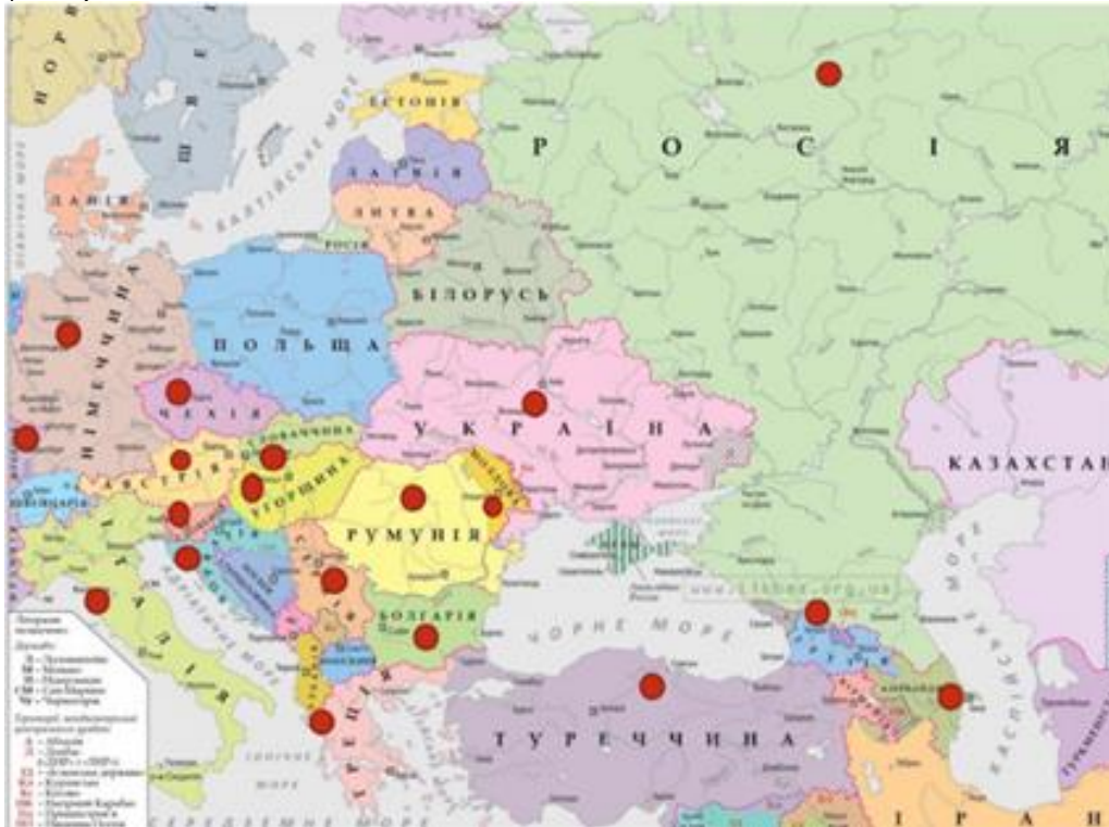
Figure 1. Distribution area of Hyphantria cunea Drury in Europe.

Region of Azerbaijan Hyphantria cunea Drury was found in 1991–1992 (Gaziyeu, 1999). At the beginning of the XXI century Hyphantria cunea Drury penetrated from the territory of Azerbaijan into Iran and began to spread in the northern provinces of the country (Gninenko, 2005).