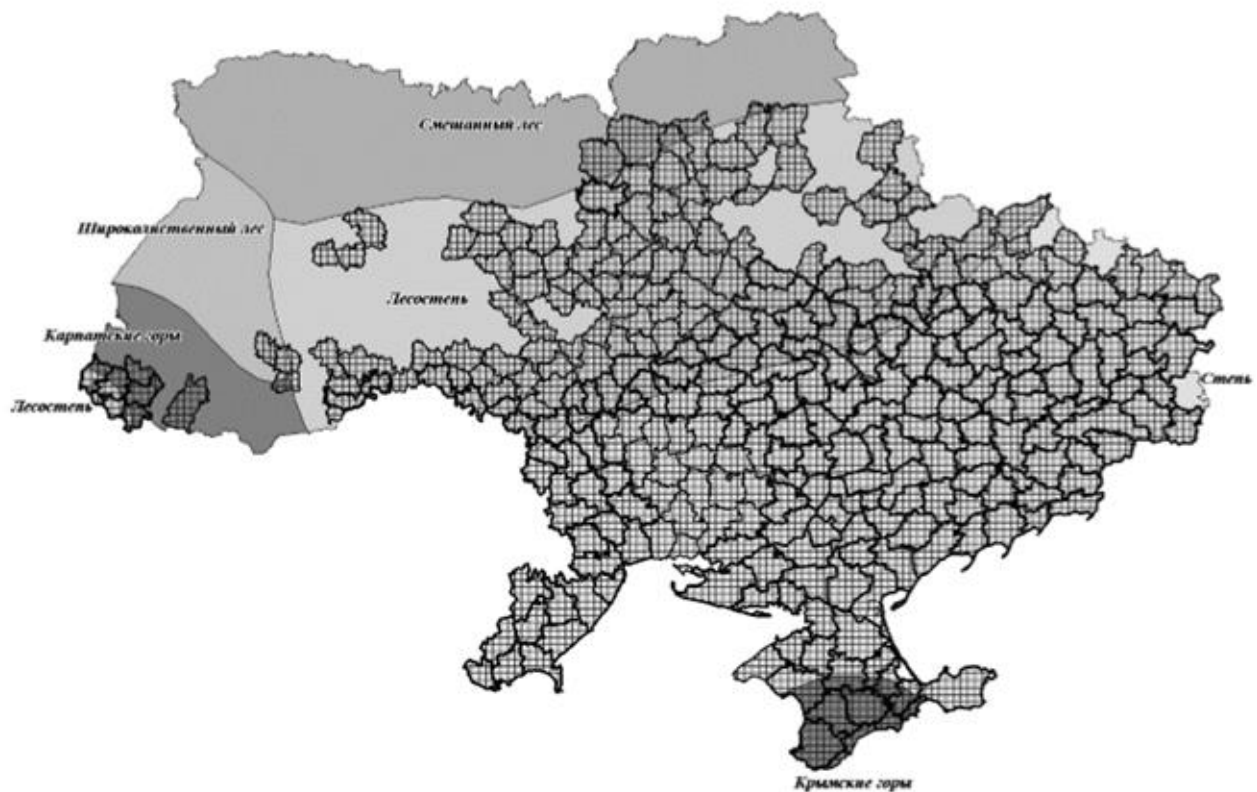
Figure 3. The administrative districts of Ukraine where Hyphantria cunea Drury has been discovered since 1952 vs Eco regions of Ukraine (Shumov, 2018)

Combining the maps of Eco regions of Ukraine and the administrative districts where Hyphantria cunea Drury was recorded, since 1952 to the present, a map of pest spreading in the steppe and forest-steppe zones of Ukraine has been obtained, which according to the basic provisions corresponds to biological characteristics of the harmful organism (Shumov, 2018) (Figure 3).